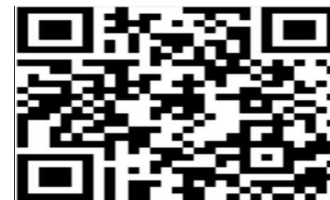
Registration Scan Code

Please pray that all the children that are participating in our VBS has ears to hear and a heart to receive the Word of our precious Lord.