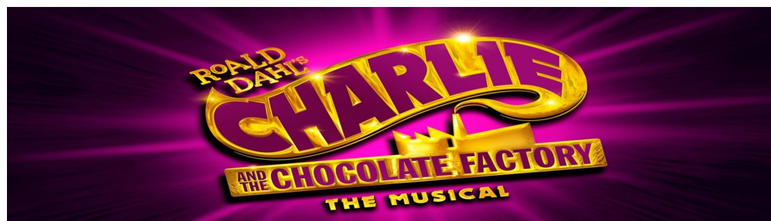
Dec 8th @1:30pm @ Hickory Community Theatre